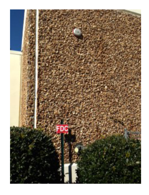
Figure 1.2 Bell